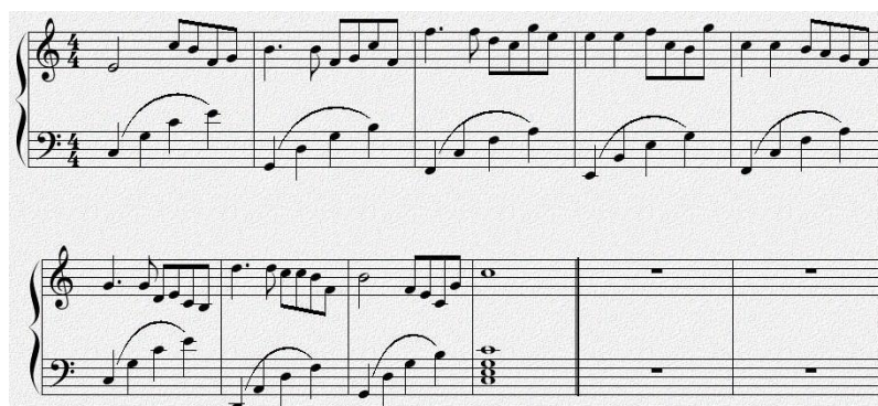
Figure 2. A sample of students’ composition work my wish presented by grand staff.